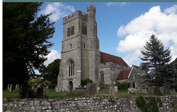
Church of Saint John the Baptist, Harrietsham

HARRIETSHAM: Harrietsham has been a longstanding settlement, taking advantage of the spring line on the lower slopes of the Downs. Archaeologists have uncovered evidence of Bronze Age, Iron Age, Roman and Saxon activities in the area. Mentioned in the Domesday Book, Harrietsham stands on various routes, ranging from the historic Pilgrims' Way, to the more recent arrivals of the railway and the M20.