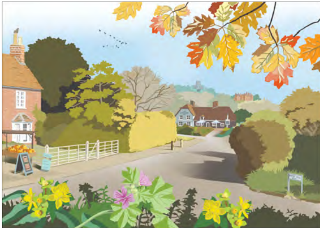
Artist's impression of Doddington Village

This walk runs from the coast (England Coast Path) at Conyer, through the Faversham Fruit Belt to the Kent Downs AONB, ending at the North Downs Way above Lenham.