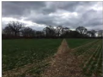
Path into Jacksons Wood

15. Turn right and follow the street past The Chequers pub and the turning for Hopes Hill, until you reach the turning on your left for Old Lenham Road. Follow the lane until you reach the footpath on your left adjacent to the allotments. The path here follows a steep slope out across the fields until reaching Jackson's Wood, an area of coppice with some large standard oak trees.