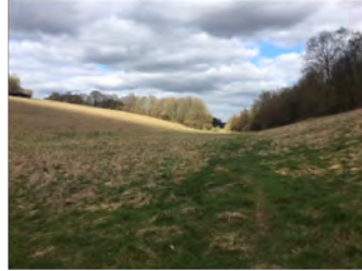
Tranquil valley, beyond Old Lenham Road

18. The track now remains straight for some time and soon you will emerge into a tranquil valley (please keep any dogs on a lead around the sheep that may be grazing here), surrounded by woodland and birdsong, where you may also be lucky enough to see Early purple orchids in spring. Crossing the stiles, you will eventually reach the head of the valley - walk alongside the woodland's edge across the field to Lone Barn Road, where there is a step and handrail.