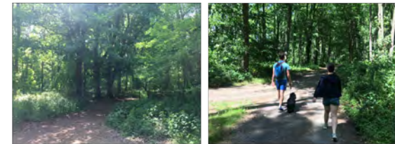
Turn sharp right through gate (text below)

11. Follow the road over the motorway and stay on it as it bears left into Sharsted Plantation, a large area of planted woodland. As you enter the woodland stay on track as it bears right and continue along what is now a straight route for several hundred yards.