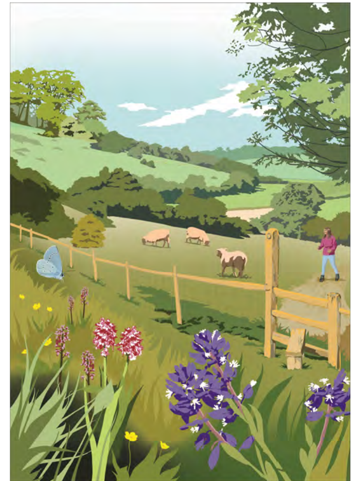
Artist's impression of The Kent Downs AONB (Sally Barton)