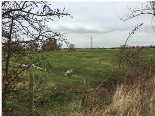
Grazing marsh between Conyer and Teynham

1. The route starts at Conyer. From the Ship Inn, walk south along Conyer Road past the houses until the road bears left directly opposite The Moorings. Just to you right on the other side of the road, there is a fingerpost between two footpaths. Take the right hand path heading into the tunnel of trees and scrub, through which you will emerge onto a long straight trackway fringed by lines of poplar trees, hedgerows and views across the adjacent grazing marsh.