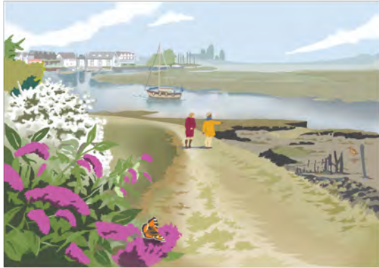
Artist's impression Conyer Creek (Sally Barton)

1. The route starts at Conyer. From the Ship Inn, walk south along Conyer Road past the houses until the road bears left directly opposite The Moorings. Just to you right on the other side of the road, there is a fingerpost between two footpaths. Take the right hand path heading into the tunnel of trees and scrub, through which you will emerge onto a long straight trackway fringed by lines of poplar trees, hedgerows and views across the adjacent grazing marsh.