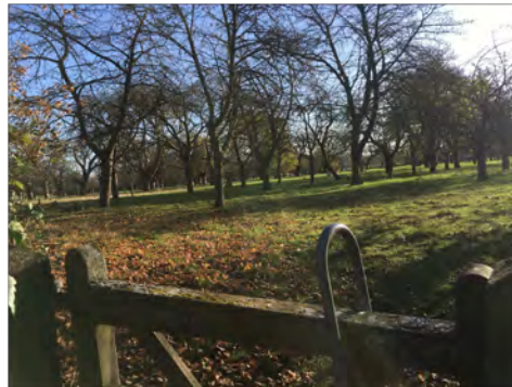
Park Farm Community Cherry Orchard, Lynsted

5. Turn left onto the road and follow for a short distance until its junction with Lynsted Lane/The Street. Turn right along The Street into Lynsted Village, taking great care as this section of the route includes some road walking. Passing the pub, church and pretty heritage buildings, carry on down the hill and then back out of the village. Once again the route includes some road walking, so please take great care, especially as there is a short stretch where the 30 mph limit ends, before you then turn left onto a small country lane, next to a traditional cherry orchard maintained by the local community and an ideal spot for a rest amongst the trees.