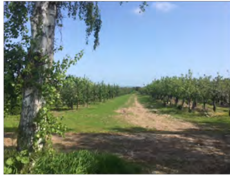
Track through orchards, South of Teynham

3. From here you have two choices, either turn left and continue until you reach the pedestrian crossing (and walk back along the southern side the A2) or turn right and follow the A2 west for several hundred yards until you reach a small builders yard. Taking great care (as it can be a very busy road), cross over the A2 here and follow the unmade track (signed as a footpath) directly opposite.