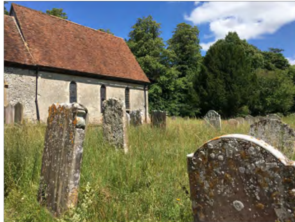
Doddington Living Churchyard

This walk includes a quiet, characterful part of the Swale coastline, crosses tranquil grazing marsh and the horticultural patterns of the Faversham Fruit Belt, before finding several grand parkland estates and the majestic chalk downland landscape of the Kent Downs AONB.