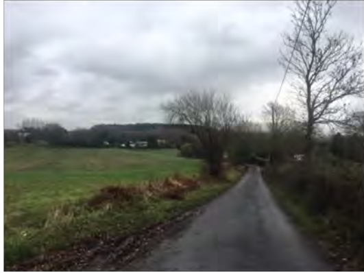
View toward the hilltops of Perry Wood, from Grove Road

9. At the next junction turn left onto Grove Road and once beyond the trees on your left, views open up briefly back down toward the coast on your left and ahead of you just to your right, the Scots Pines on the hilltops at Perry Wood.