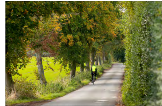
Heading along the gently undulating road, there are views across the landscape to Perry Wood, to the South East (your left).

6. At Clockhouse Lane, turn right, taking care to avoid the many potholes and continue along the lane until you reach the next junction. Turn right here and then almost immediately left into the next Owen's Court Road.