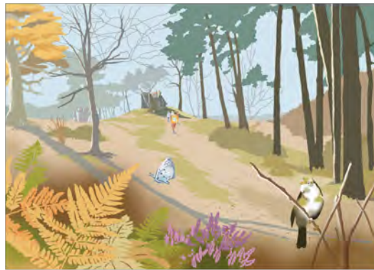
Artist's impression of Perry Wood (Sally Barton)

Once you've locked up your bike (and had a drink at the pub), why not take a walk to the tops of the hills, to enjoy the wildlife and the panoramic views at this special place? Find out more at www.perrywood.org.uk