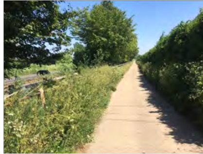
Track alongside M2, lined with shelter belt of poplar trees

4. Just before the traffic island (which you can use to cross the A2 if necessary) about half a mile along the road, take the next right into Salters Lane, signed to the Household Waste Centre and continue along the lane until you reach the bridge over the M2 motorway.