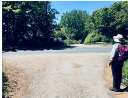
Please take care crossing Selling Road, consider dismounting here

5. Just over the bridge turn left, taking the rough track alongside the motorway. Continue along the track until you reach the junction with Selling Road (where you can turn left to stock up on supplies at Macknade Fine Foods). Cross carefully and continue on the unmade track, taking you past orchards and soft fruit, until you reach Clockhouse Lane.