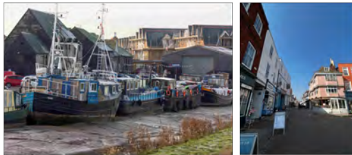
Faversham Creek and Town Centre

1. Starting at the junction of Abbey Place and Abbey Street, on National Cycle Route 1, continue along Abbey Street until its junction with the B2040, where you either continue along the road or dismount and walk through the town, before rejoining the route at Faversham Railway station.