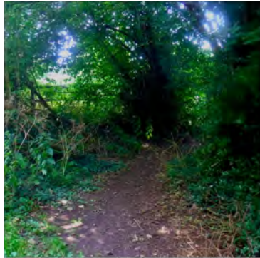
Turning onto bridleway from Grove Road

10. As you reach the houses, look out for the fingerpost showing the bridleway on the right hand side.