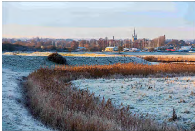
Faversham Marshes (can be accessed via National Cycle Route