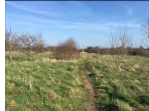
Rough grassland and scrub at Silver Street (looking back toward the houses)

10. Turn right here up the steps and onto the footpath into an area of grassland and scrub. The route then takes you out across open farmland. Continue to head west across the field until you reach a footpath junction.