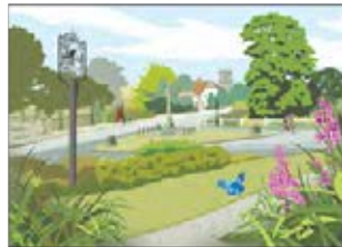
Artist's impression of Bredgar Village (Sally Barton)

9. Upon reaching the large village pond, turn right into Gore Road. Continue along the road until you reach Silver Street. Turn left into Silver Street and look out for the finger post on your right at the end of the row of houses.