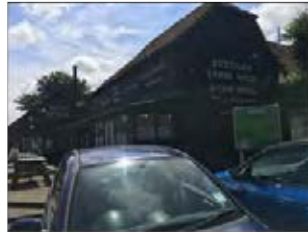
Bredgar farm shop and tea house

Why not take a break in this lovely village centre?