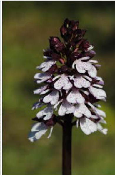
Lady Orchid in the Kent Downs AONB

The walk traverses coastal marshes, townscape, fruit belt and arable land, pretty villages and ancient woodland stacked with wildlife. There's plenty to see and do along the way.