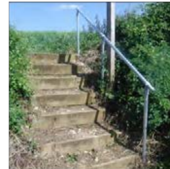
Steps onto Bicknor Lane

12. At Deans Hill Road, taking care, cross immediately over the road up onto the adjacent footpath and follow it across across the field. There are some steep steps and a handrail at the far end, which take you down onto Bicknor Lane.