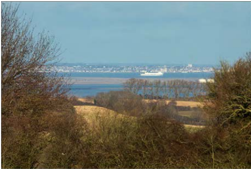
View from the Hucking Estate woodland back down to The Swale.

This walk runs from the coast (England Coast Path) at Milton Creek to the Kent Downs AONB, ending at the Hucking Estate and the North Downs Way. You can start this walk from coast or downs. There is also a circular Linking Coast to Downs Route 4, around Borden and Bredgar, part way along this linear route.