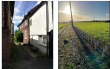
Path between buildings and newly planted hedge at Borden

5. Turn left into Pond Farm Lane and look for the signed bridleway between the houses, on the corner of the lane opposite the church. This route then heads out into open farmland, with a newly planted hedgerow to your right just beyond the farmyard.