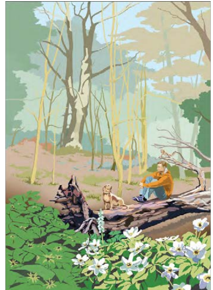
Artist's impression of Gorham and Admiral's Wood (Sally Barton)