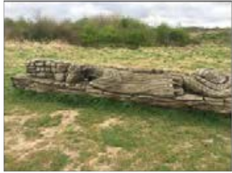
Sculpture at Milton Creek Country Park

1. Starting at Milton Creek Country Park, leave via the gate adjacent to Holy Trinity Church and crossover the road into North Street. Upon reaching the roundabout, turn left into the High Street and continue along this road until Crown Road.