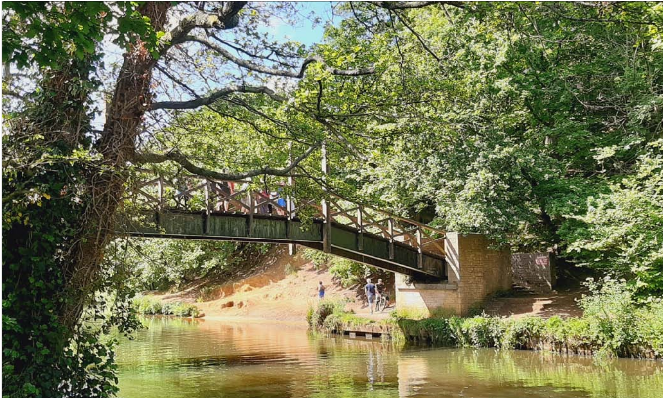
River Wey bridge at St Catherine's

A relatively easy introduction to the NDW with no major hills to climb. This is a very peaceful and rural section but with good options for refreshments and exploration.