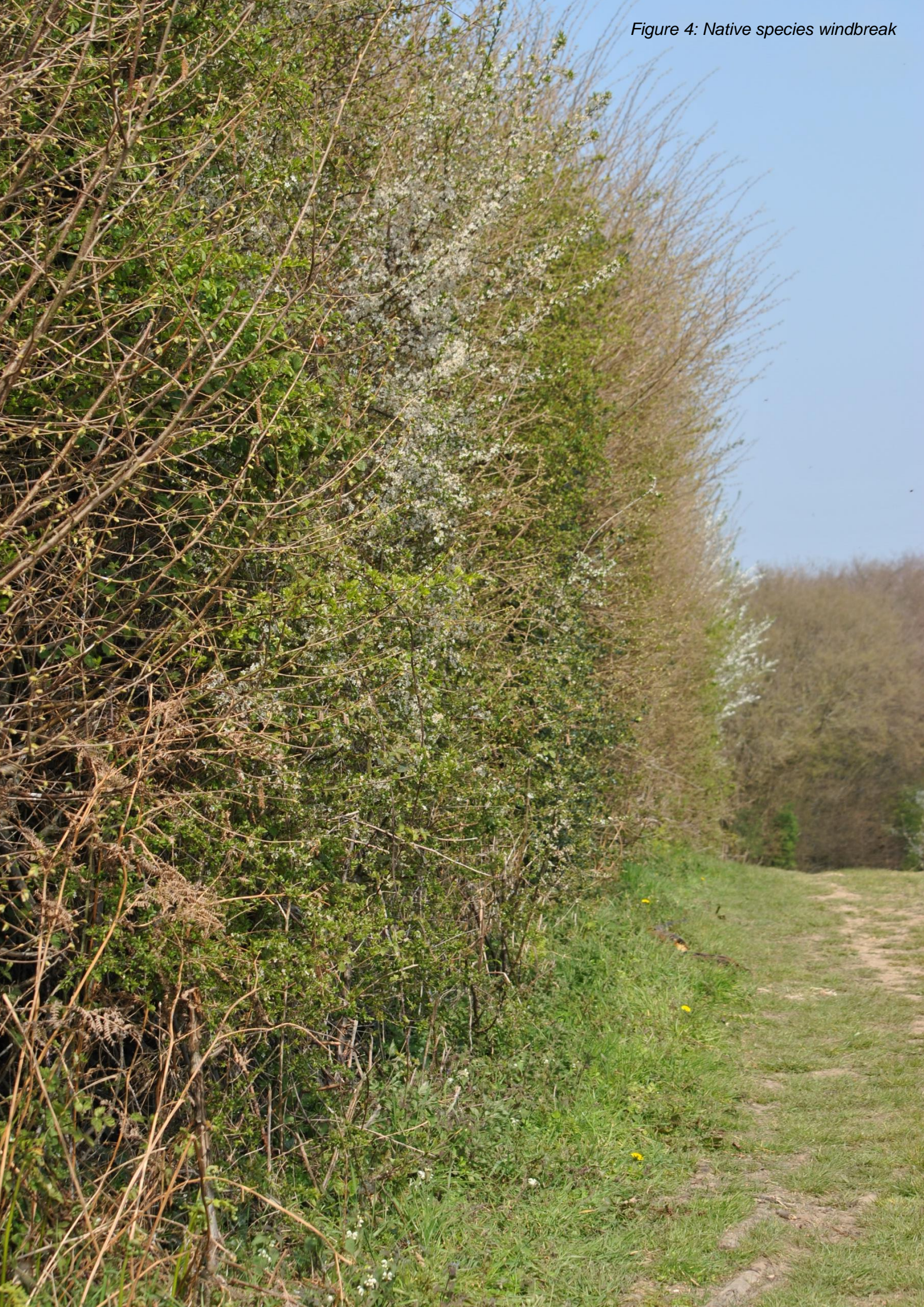
Figure 4: Native species windbreak