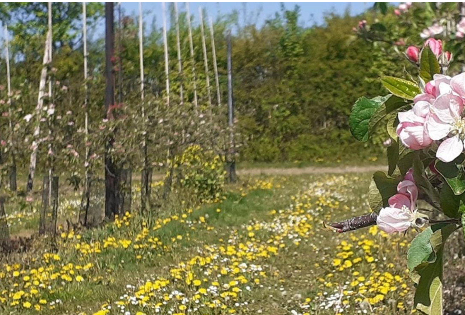
Figure 6: Insectary plants in orchard

https://www.gov.uk/government/publications/sustainable-farming-incentive-scheme-pilot-launch-overview/sustainable-farming-incentive-defras-plans-for-piloting-and-launching-the-scheme#annex-1