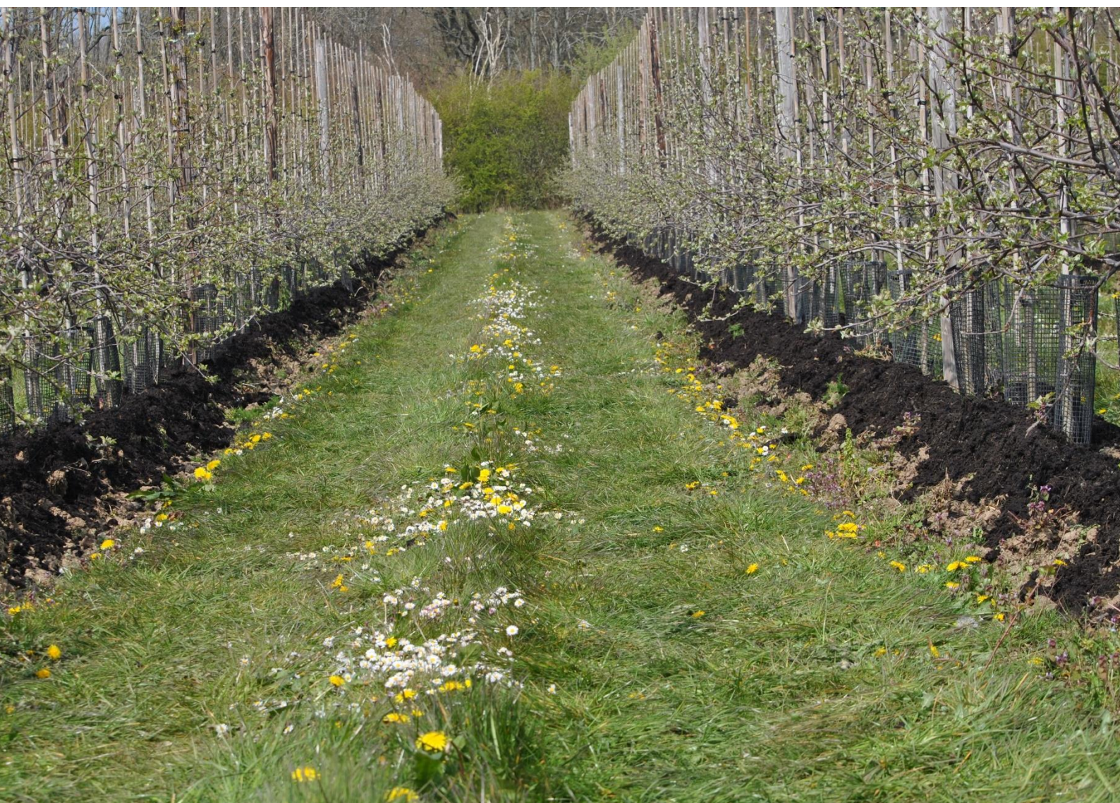
Figure 1: Apple trees with green compost

The production of a simple Land Management Plan (LMP) by a grower involves relatively little cost but would also generate correspondingly limited impact on the farm environment. A LMP that will generate measurable and valuable change in the farm environment will require a professional survey and detailed advice on planning and implementation. Clearly the scale, scope and cost of such a LMP would depend on the size of the holding and number and types of production sites. Support within the new schemes should reflect this.