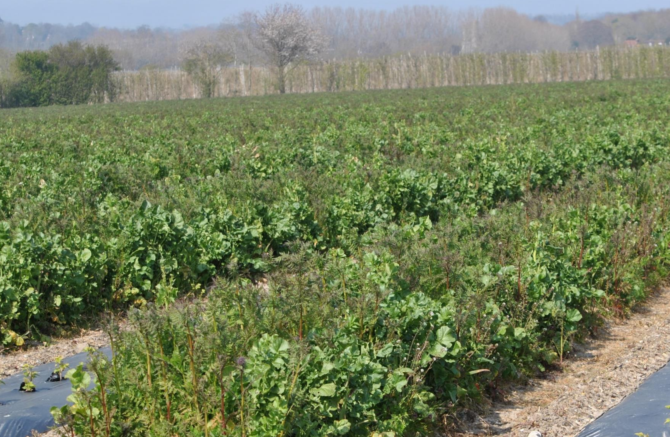
Figure 3: Cover crop between newly planted blackcurrants