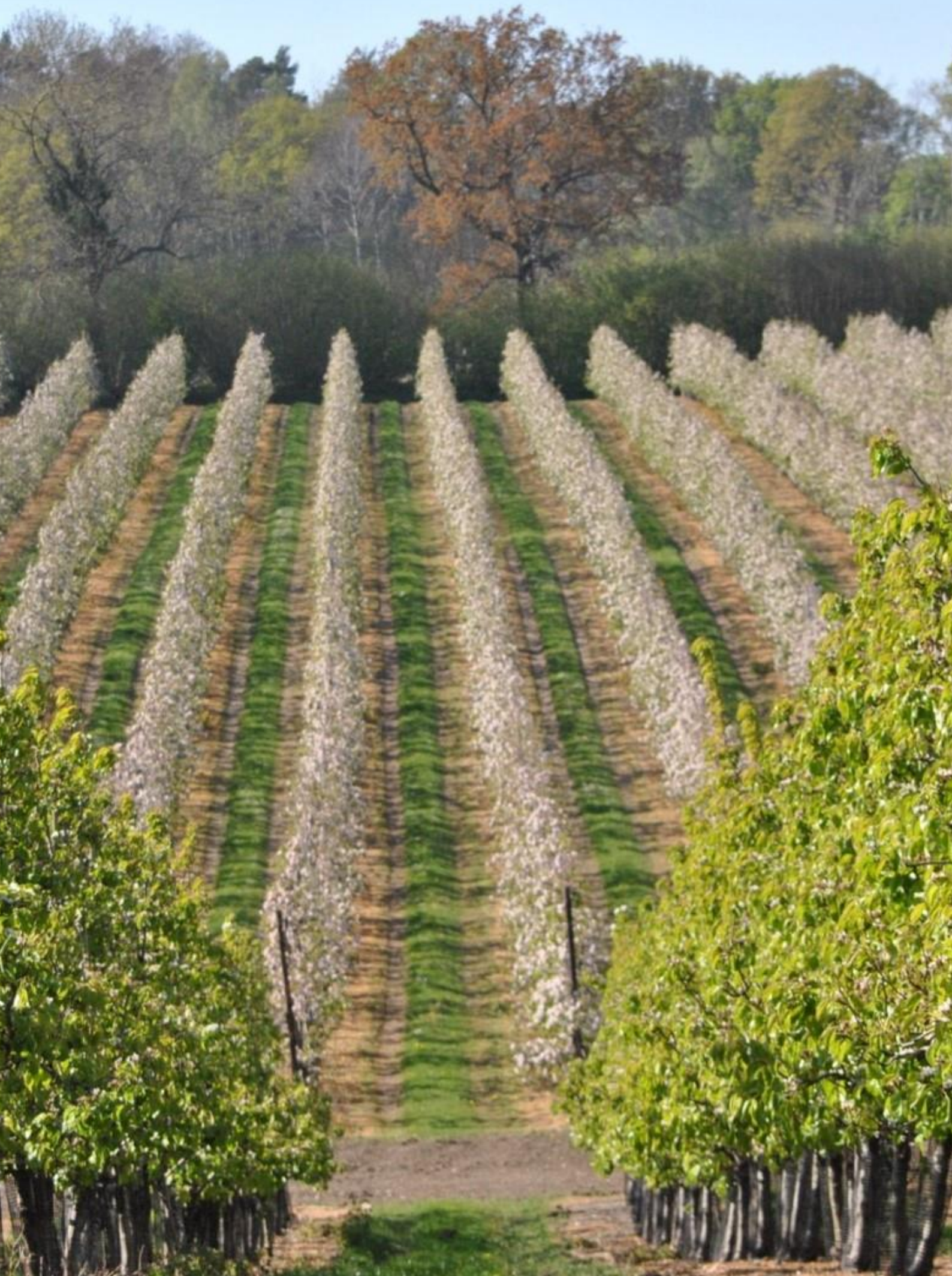
Figure 5: Pear and apple orchard