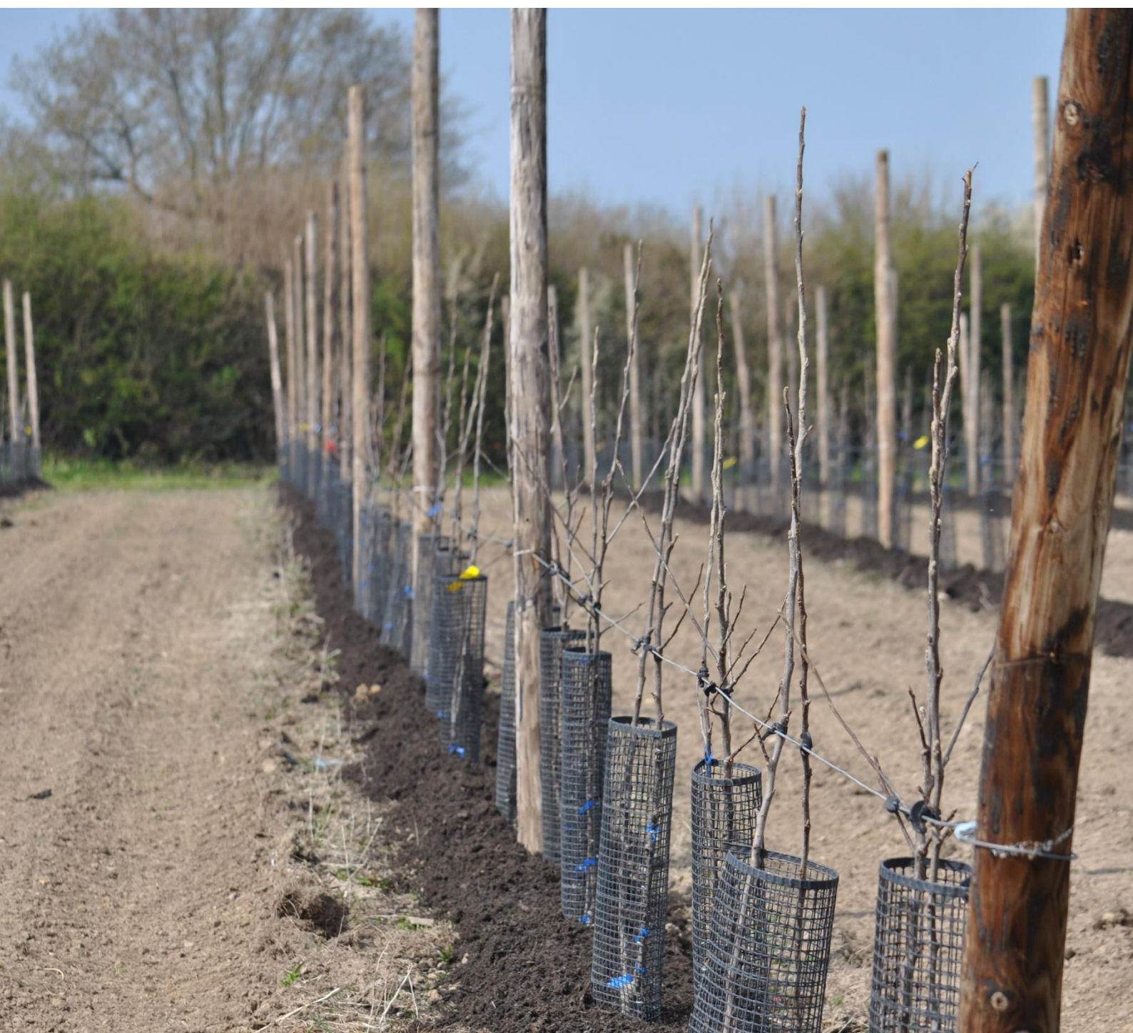
Figure 7: Newly planted orchard with green compost