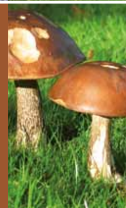
Meadow, Orange Bolete, Ox-eye Daisies and Canada Geese