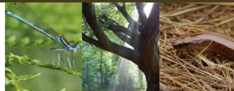
White-legged Damselfly (VWPT)

At the lake you may also be lucky enough to see a grass snake swimming as it hunts for small amphibians and fish. While in the park keep your eyes peeled for slow worms (legless lizards) and viviparous lizards too. Recently Vinters Park has become a receptor site for reptile relocation and several releases of slow worms have taken place here.