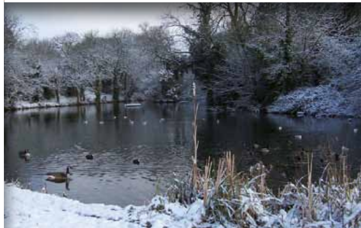
Canada Geese (Vinters Valley Park Trust)

A 4 mile / 6.5km circular route from the middle of Maidstone through the town centre, Vinters Valley Nature Reserve and woodland.