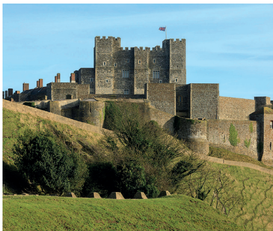
The Romans placed two lighthouses, known as pharos, to alert seafarers in the treacherous Dover Straits. One was built at nearby Dover Castle and a second on the Western Heights.

PUBLIC TRANSPORT: For information about local bus and train services in Kent, check out kentconnected.org