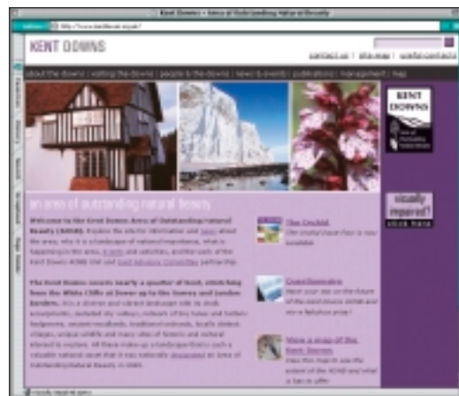
Kent Downs website homepage

The AONB Unit recently submitted an application to the Heritage Lottery Fund for a 'Project Planning Grant'. This grant will supply funding for a new officer who will be dedicated to preparing a 'Landscape Partnership Scheme' application to HLF. Landscape Partnerships are complex projects but could provide significant new funding for the Kent Downs.